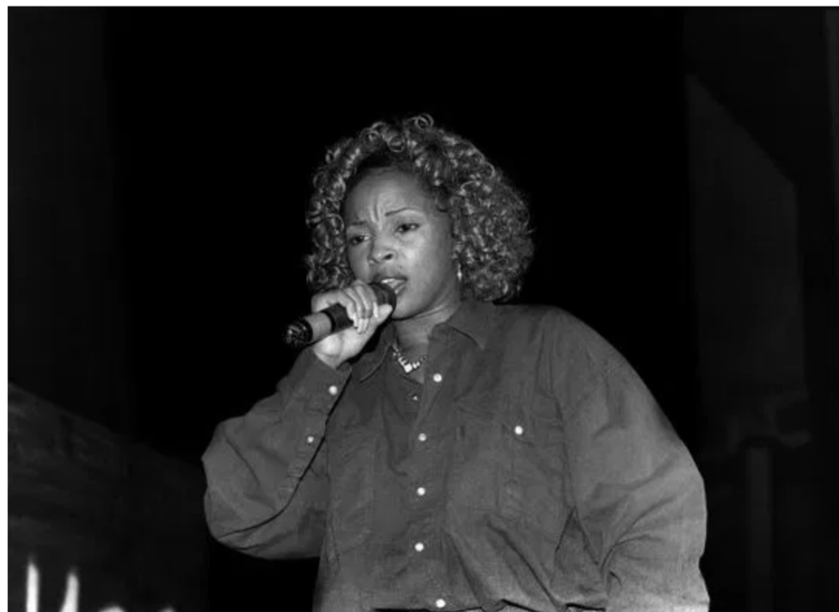
Blige in 1992

She wasn't her own worst enemy as so many in music today are. She played the long game.